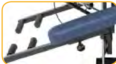
Patient Gripper Bar