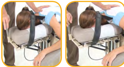
Flexion and rotation Headpiece