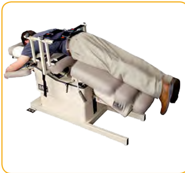
Hill AFT Scoliosis Treatment Package