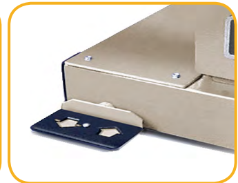
Rocker Foot Pedal

Mounted on both sides of the table base for easy height adjustment.